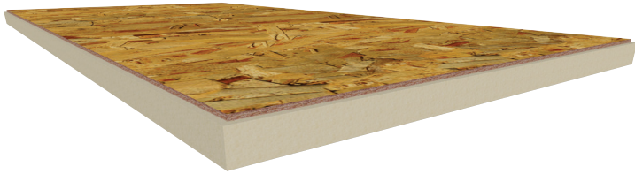
H-Shield NB Manufactured by Hunter Panels

Flat Polyisocyanurate Insulation Manufactured On-Line to Oriented Strand Board